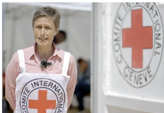
9 May – A Movement response ( YouTube )