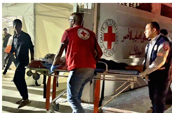
26 May – a mass casualty incident ( X , FB AR )